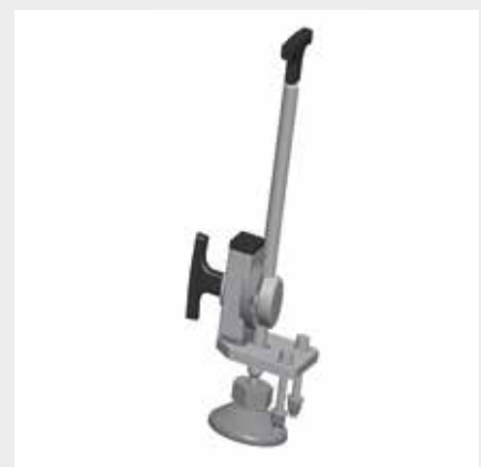
10.421 Locking stabilizer for closed unit