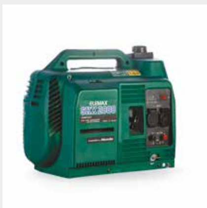
10.412 2KVA Silenced Generator