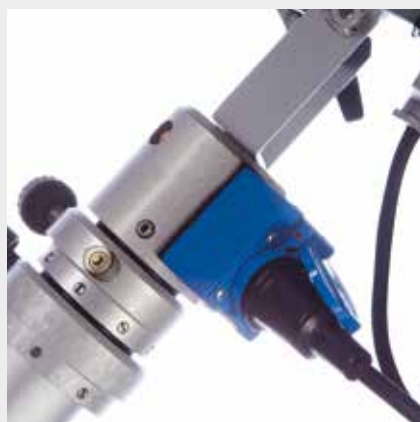
BP.3400 Schuko socket and plug